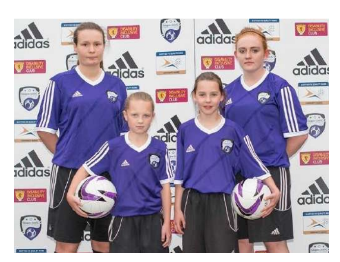
Women and girls of all ages are welcome at the club

The Women's Fund for Scotland awarded the team a grant of £9,408.00 in 2019. Grant monies were used to support the provision of training and qualifications for 12 young women to become volunteer football coaches within the organisation. It was hoped that these young women (16-25) would gain a Scottish Football Federation (SFA) Level 3 certificate. This qualification would then be used to coach younger girls in the club aged between 12-16 years. Glasgow Girls FC anticipated that the project would equip women and girls with new skills, improve their overall health and well-being and build confidence and self-esteem.