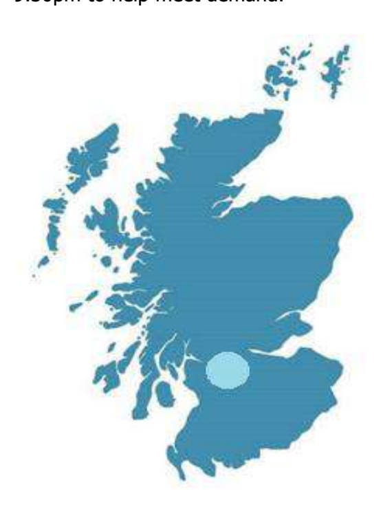
Glasgow Girls FC SCIO operates out of Shettleston, Glasgow

Glasgow Girls FC was established 2011 to provide football activities to girls, young and adult women, living in Glasgow, as a healthy, safe and fun means of sport and recreation. The club provides football coaching and 16 community football teams to girls and women of all ages, abilities and levels. The club enables women to improve their football skills and methods whilst participating in community tournaments. The club's facilities are located in Shettleston, Glasgow with each age group training on average 2 evenings per week with a football game at the weekend. The group accommodates all ages and abilities and have training sessions running Monday to Friday 6pm-9.30pm to help meet demand.