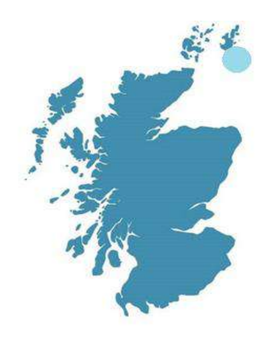
Young Mum's operates out of Lerwick

Young Mums Shetland was established in 2010. They provide a weekly support group for young mums aged 16-25 years living in and around Lerwick in Shetland, who attend with their babies and young children. They have a coffee and chat and take part in activities such as cooking sessions, play, and training. Young Mums meet at Sandveien Neighbourhood Centre in Lerwick on a Thursday from 12.30-2.30 pm, with occasional outings and training at other times. The group has 25 members on its Facebook page, but weekly attendance tends to be around 12, with a core group of 8 young women attending most weeks.