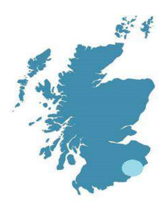
Nature Unlimited operates out of Selkirk

Nature Unlimited's (NU) aim is to nurture individuals' wellbeing, and resilience and build community through activities that use local woodlands. Since 2015, NU has run sessions for all ages in woodlands across the Scottish Borders, ranging from employability community programmes, projects, mental health sessions and team building. Activities include growing food, outdoor cooking, natural art, green woodworking, and traditional crafts. These activities aim to build confidence and develop skills. Examples include intervention programmes for 100 children/young people who are not thriving in mainstream education and work with NHS Borders providing sessions supporting the wellbeing of 50 adults with severe and enduring mental health conditions.