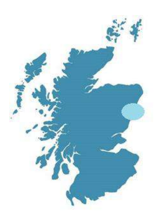
Grampian Women's Aid operates out of Aberdeen

Grampian Women's Aid was established in 1977. They provide crisis intervention, information, advice, refuge accommodation and outreach support to women, children and young people living in the Aberdeen City and Aberdeenshire areas. They also deliver training to other organisations. They have a full-time office based in Aberdeen which is open Monday to Friday 9am-5 pm and manage a range of accommodation options including a communal refuge, a block of 6 flats and stand-alone scatter flats. Between 2019/2020, the organisation provided refuge and support to over 500 women and 400 children.