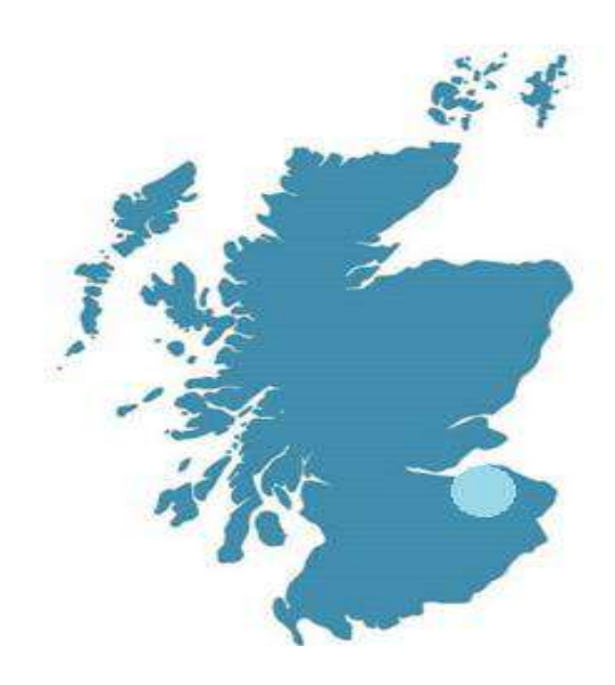
Multi-Cultural Family Base is active in Edinburgh

The Multi-Cultural Family Base (MCFB) was established in 1998 in Edinburgh. It aims to enhance the well-being, self-esteem and life opportunities of vulnerable children, young people, and their families in Edinburgh. 80% of the beneficiaries come from the Black, Asian and Minority Ethnic communities in Edinburgh. This past year MCFB worked with over 530 individuals providing an Early Years' Service Parent/Toddler Groups, access to English classes, family support services for mothers and children affected by domestic abuse, those experiencing Honour Based Violence and Female Genital Mutilation (FGM). This work is delivered through one-to-one sessions and group support at people's homes or at accessible public venues on a flexible schedule person-centred timetable.